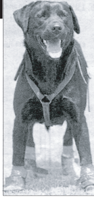
SMART: Fire dog Star